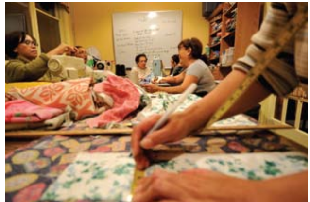
Latin Sol Sewing Class at Neighbors Link.

Neighbor's Link is a bicultural community center located in Mount Kisco, NY, serving the Latino and working poor population. In addition to providing a Worker Center for both skilled and unskilled workers, they also provide daily classes and programs for adult education, employment, and economic development. The Center offers daily on-site help and referrals for housing and homelessness, domestic violence, immigration issues, medical and mental health issues as well as for alcohol and drug dependency. This grant was awarded to help support their programs and services.