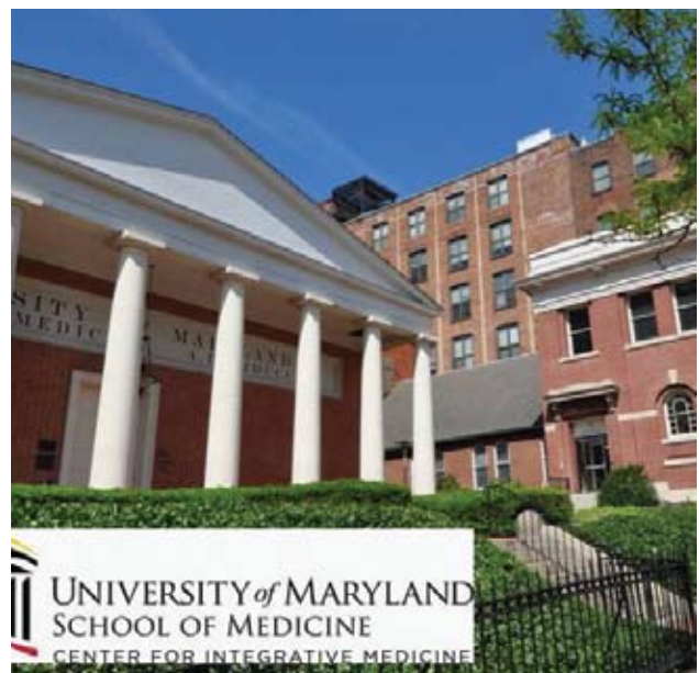
East Hall is the new home of the Center for Integrative Medicine’s academic offices.