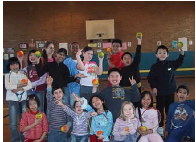
Kids participating in NYJTL's Schoolyard Tennis Program which incorporates tennis into the physical education curriculum of NYC public schools.

The New York Junior Tennis League, located in Queens, NY, is the official New York City chapter of the United States Tennis and Education Association. They are dedicated to transforming youth's lives through tennis. This grant was awarded to support after school programs.