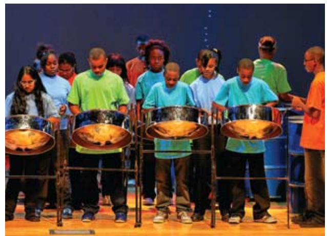
After-School Steel Pan Band from IS 285 (East Flatbush, Brooklyn) performing at Foundation's First Annual Winter Performing Arts Showcase.

The Foundation, located in Queens, NY, provides school-based after-school programs in New York City and Mount Vernon, NY. The students typically live in low-income neighborhoods and attend academically struggling schools in K-12 in all five boroughs. This grant was awarded to support their programs and services.