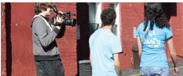
Teenage students filming in the community for their “Getting the Shot” class at the Media Arts Lab.

The Film Center, located in Pleasantville, NY, is an educational and cultural institution dedicated to presenting the best of independent, documentary, and world cinema promoting 21st century literacy. The Center provides opportunities for people of all ages to discover, explore, and learn through the power of film, media and 21st-century technology. The Film Center was awarded grants to support their Virtual Learning Platform initiative focusing on technology, storytelling, and life skills curricular content ($1,758,250); and capital improvements supporting their state-of-the-art theater complex, a 27,000 square-foot Media Arts Lab, and a residence for international filmmakers ($1,000,000).